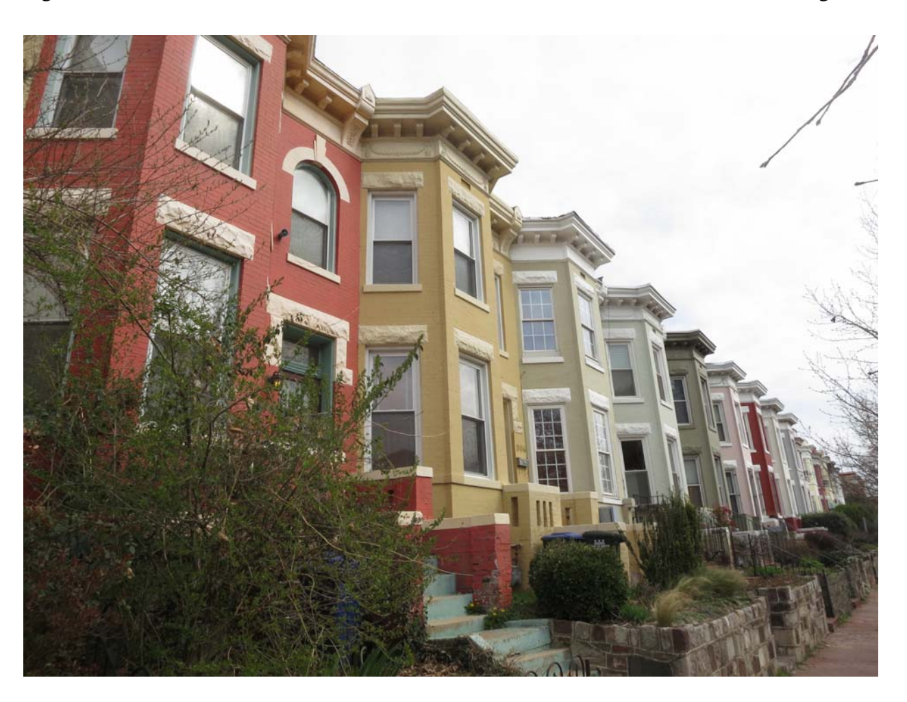
Figure 2. Classical Revival rowhouses on the 300 block of G Street, NE, north side, looking east.