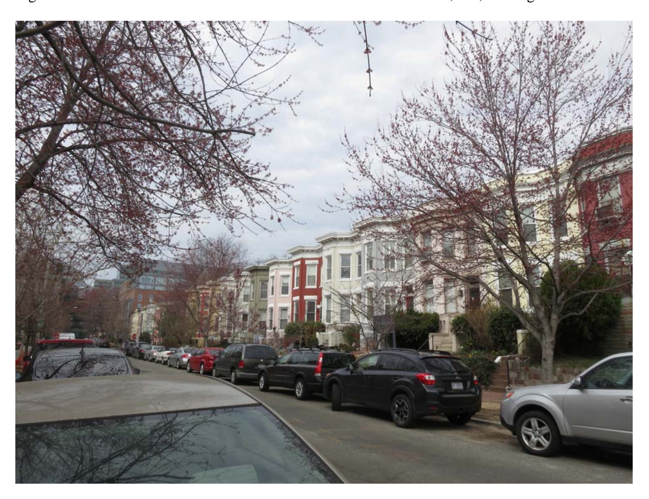
Figure 3. Classical Revival rowhouses on the 300 block of G Street, NE, looking west