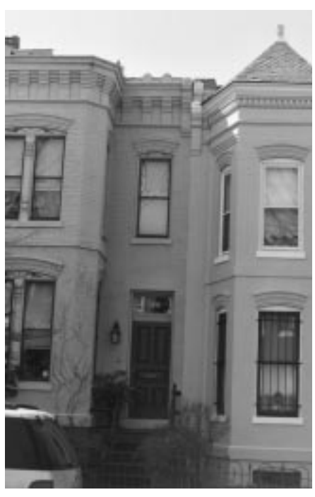
510 3rd Street, NE

and late nineteenth-century American Renaissance bookcases flanking the fireplace celebrate this home's roomier proportions.