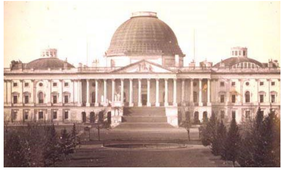
Capitol and east grounds, Daguerreotype by John Plumbe, Jr., ca. 1846. Library of Congress.

ne of the treasures of the Library of Congress is a journal kept by Francis (Frank) Ormand French (1837–1893) published by the Library of Congress in 1997 as Growing Up on Capitol Hill: A Young Washingtonian's Journal, 1850-1852. The French family home stood at 37 East Capitol Street until the 1890's when it was torn down to make way for the Library of Congress. The following excerpts show how the Fourth of July was celebrated at that time. (The spelling is as in the original; the bracketed phrases are scholar's notes.)