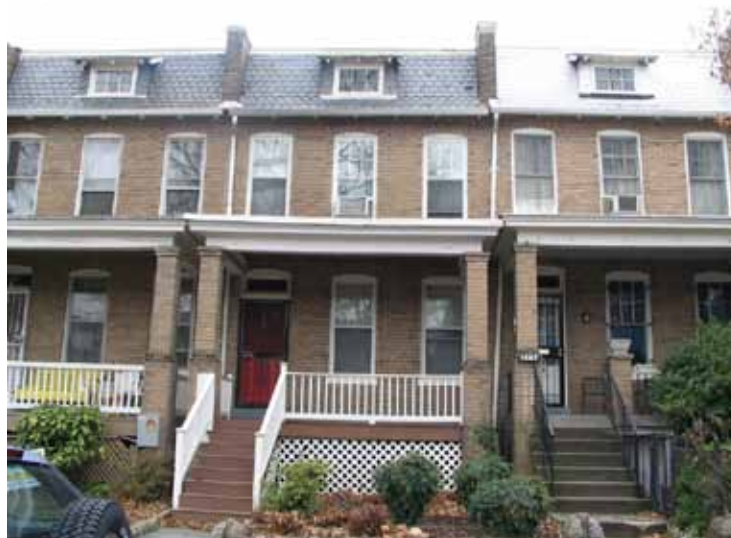
1609 E Street, SE: Jameson (1919). Brick porch-front house with mansard roof, fish-scale slate tiles, shed dormer with overhanging eaves and exposed rafter ends.

Thomas A. Jameson (active 1910s-circa 1930) built hundreds of brick porch-front rowhouses in the 1910s and 1920s. His rowhouses typically feature beige brick, and full width porches, brick columns, flared slate mansard roofs with shed dormers (and exposed rafters), in contrast to Howenstein’s straight mansard roofs with gable dormers.