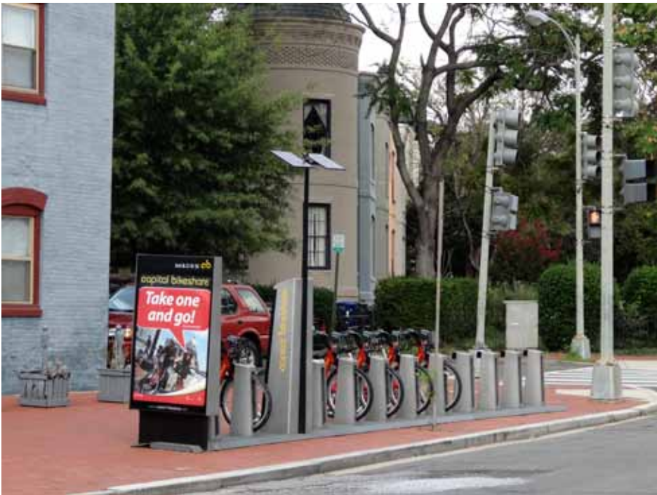
CaBi station at North Carolina Ave and 3rd Street SE.

In issuing the IFB, DDOT solicited proposals from companies who would have exclusive authority to place ads on the side opposite the maps. Revenue from the ads would help sustain the CaBi program. Such wholesale advertising, controlled by the winning bidder, at over 120 CaBi stations throughout the District, would have significant potential to adversely affect streetscapes and residential neighborhoods in the Capitol Hill Historic District, as well as others all over the city. An August 9 amendment to the IFB excluded seven CaBi locations on National Park Service and GSA property from the bid and prohibited advertising on panels in five low-density residential neighborhoods, including two on Capitol Hill, which is a good start. CHRS maintains, however, that DDOT has not yet gone far enough to protect historic residential neighborhoods from these ads.