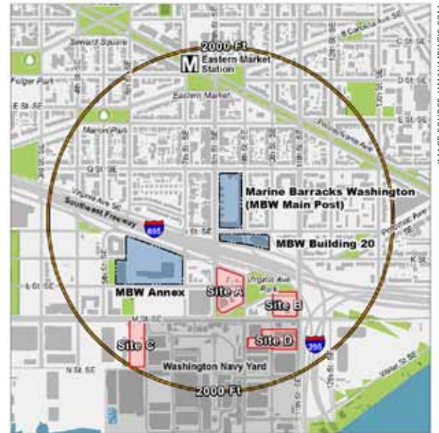
MBW Properties and Alternative BEQ Complex Sites Marine Barracks Washington (MBW), D.C. Key MBW Properties: Buildings, Parks, Water Alternative BEQ Complex Sites: Buildings, Parks, Water 2000 Ft Buffer from MBW Main Post

Site B (Square 976 and a portion of L Street, SE) is immediately adjacent to the Capitol Hill Historic District. Building the BEQ on Site B, in the southeast "notch" abutting the historic district, would adversely affect the historic district's integrity by changing the historic district's use and setting, and by introducing a major incompatible visual element. These concepts may sound abstract, but by looking at the BEQ designs, it's easy to see the problems. The BEQ designs, particularly the 8-story and