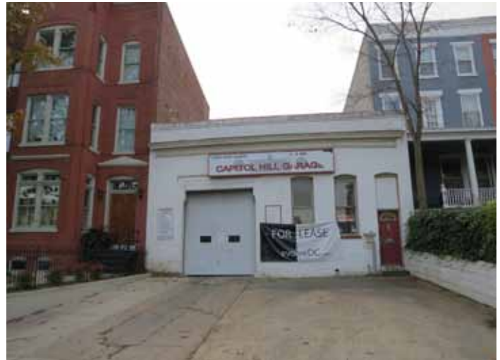
Garage at 645 Maryland Avenue, NE.

CHRS believes that HPRB’s more recent precedents from 2012 and 2013