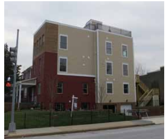
Pop-up at 1701 Independence Avenue, SE.

the pride and craftsmanship of the original builders and radiating the warmth of the generations who have lived in them. Now the visual landscape is interrupted by outrageously ugly pop-ups that reflect only the love of money and a complete disdain for design and responsible construction techniques. Small yards and solar panels are shaded by towering additions whose message is clear ‘my wishes are more important than the comfort of my neighbors.’ I thank my lucky stars every day that my home is within the Historic District but others are not so fortunate. This text amendment would go a long way toward offering my friends and