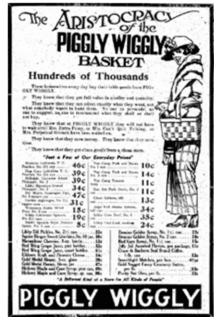
Piggly-Wiggly advertisement in Washington Evening Star , 1920