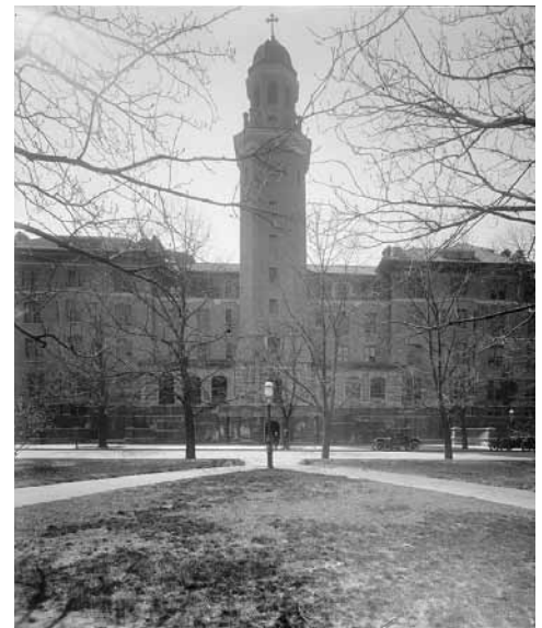
TOP: Staff at Providence Hospital circa 1895. BOTTOM: The hospital circa 1910.

Department and was eventually abandoned in 1964 when it was razed for a parking lot. The hospital moved to its current location, 1150 Varnum Street, NE in March 1956.