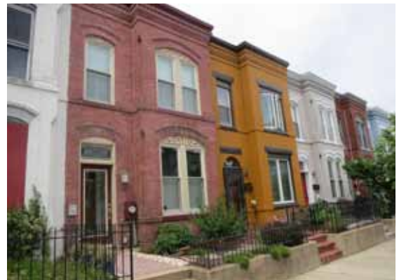
A view of Emerald Street, NE.

For more details, or to RSVP (optional), contact the CHRS office at: caphrs@aol.com or (202) 543-0425.