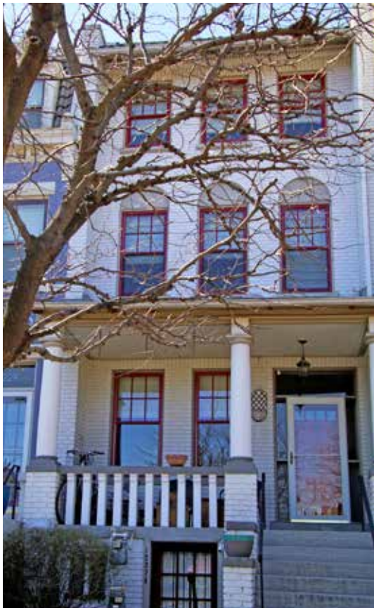
The outdoor spaces are just as unique as the indoors at 1227 Massachusetts Avenue SE.