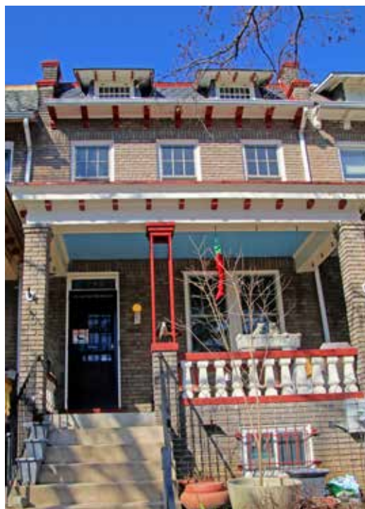
HOUSE IMAGES COURTESY BILL KOHUTANVYZ