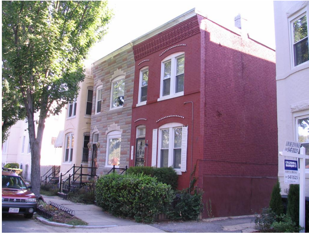
The oldest buildings on Elliott Street – 637 and 639 – date to 1892.

The 1903 Baist Real Estate Atlas (above) shows the north east side of Elliott Street developed first. (Library of Congress)