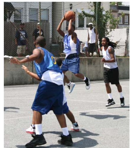
Young Ballaz Vs. Disciples at Kingsman Field, July 17.

Please contact the UFA at 671-5133 or visit ddot.dc.gov and click on the “Trees” link to become a Canopy Keeper, receive a free watering device, and help street trees survive the summer.