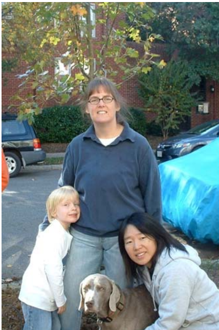
Kempton family Sweet Gum on A St.

Many, many thanks to Trees for Capitol Hill for heavily subsidizing the purchase, to the neighbors who contributed toward the cost, and to everyone who helped plant!