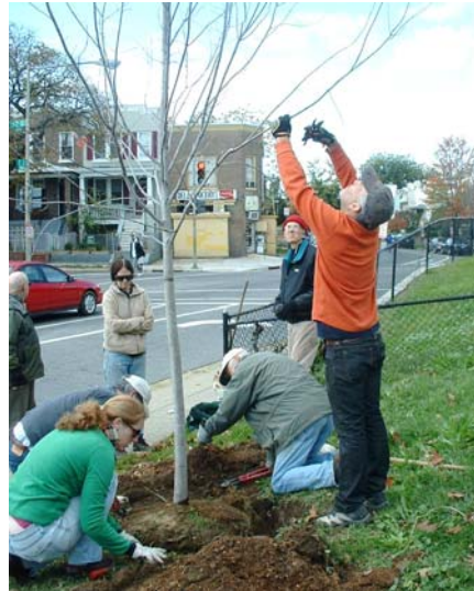
Maple at 15 th & C St. bus shelter