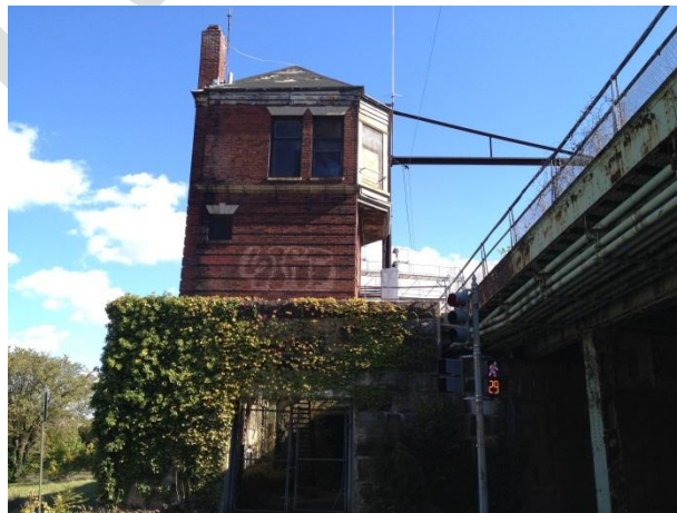
Control Point Virginia Tower, November, 2013