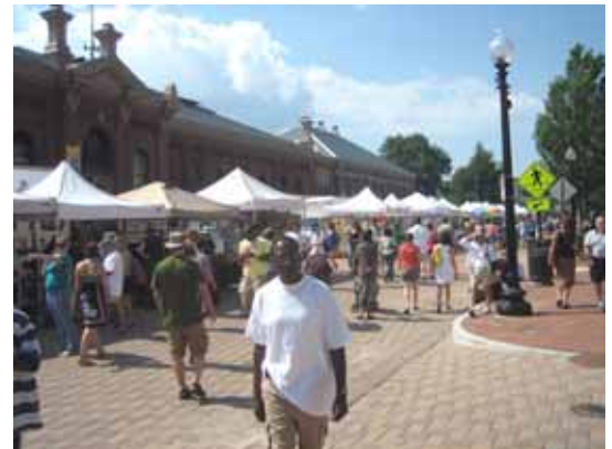
New and improved 7th Street today

In the 1980s the Market, along with the rest of the District, again lost some its vitality and patronage. In addition, day-to-day maintenance was neglected, as were long-term needs. The recent resurgence of the Market was triggered by the 1990s Eastern Market legislation that instituted a new framework for the