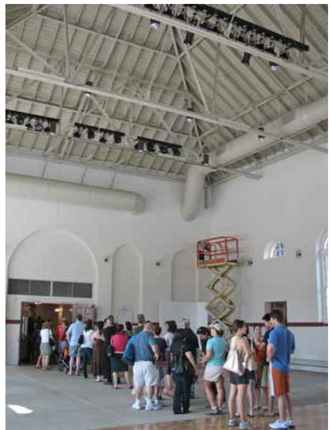
Market Lunch line in the new North Hall

An immediately noticeable change in the South Hall is the brightness provided by new skylights and new window glazing. After the fire, the frame structures for the skylight system were discovered. Even though there is no record of glass ever having been installed in the frames, some believe the framing indicates skylights were planned. The skylights are fitted with a special glass that minimizes UV transmission and improves the appearance of the displayed foods. Also, the new windows have tinted glass, to avoid an overly-bright, washed-out appearance of the displayed food. The area lighting is controlled by a dimmer system to provide a uniform level of light and reduce energy usage. Another change in the South Hall is the addition of kiosks along the walls that provide air for heating, cooling, and ventilation and also