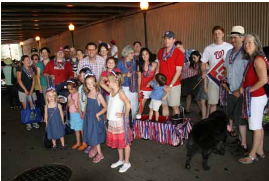
CHRS contingent in the Capitol Hill 4th of July Parade.

As part of our “Beyond the Boundaries” program, Society volunteers are engaging in a variety of outreach activities, most recently fielding a contingent in the Capitol Hill 4th of July Parade. Members marched with their friends and families, tossing Mardi Gras beads into the crowd.