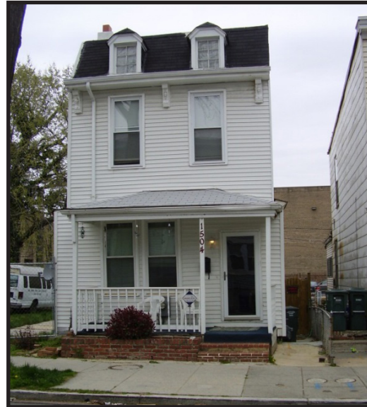
FIGURE 14: Wood-frame house at 1504 Gales Street, N.E. (EHT Tracerics 2012)

population, the fire limits were reduced in certain areas of the city to encourage development and allow the construction of much needed housing. Thomas B. Entwistle, the city's building inspector, allowed construction of wood-frame buildings in the undeveloped area of Capitol Hill to the east of 11th Street and north of I Street, N.E. Entwistle contended "that the owners of the commons thus thrown open to any sort of safely-constructed building were owned mostly by poor men, who could in many cases put up a frame house of their own while it would take years more of hard saving to afford a brick." The inspector thought these "shanty builders to be the pioneers of the city, and dislikes to see them restricted in a locality where they will perform their legitimate function of colonizing and preparing the way for more pretentious buildings." 14 By 1887, with prompting from the East Washington Citizens Association, the fire limit boundary was moved from 11th Street to 15th Street, between Florida Avenue and Potomac Avenue.