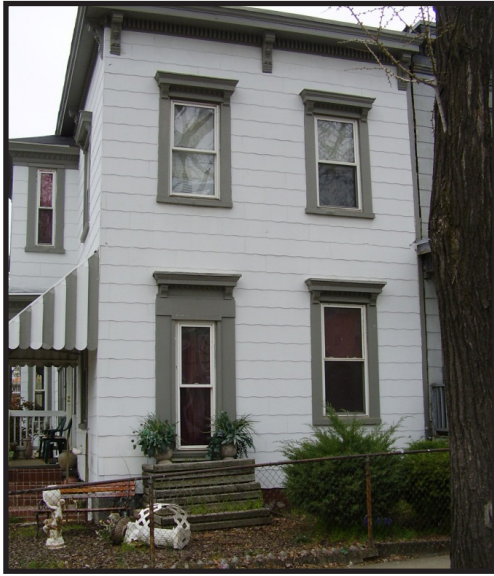
FIGURE 13: Wood-frame house at 700 16th Street, N.E. (EHT Tracerics 2012)