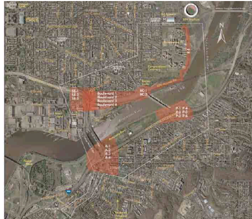
Figure 38. Location of Long-Term Improvement Options

Figure 38 provides an index of the locations for the various long-term improvement options. Appendix M contains the geometric data associated with each long-term option.