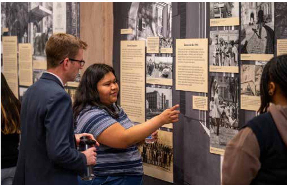
OPPOSITE PAGE, TOP: Eastern High School today. BOTTOM: Students at Eastern in 1960 take a test by punching holes in an IBM card with a stylus. THIS PAGE, TOP: Eastern students in front of the building in 1965. BOTTOM: The 100 Years of Eastern High School exhibit installed.